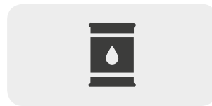
Used Engine Oil