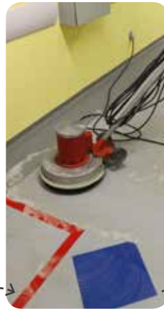
3 Agitate Agitate the cleaning product to release agents.