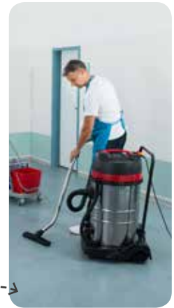
5 Remove Remove the cleaning product from the floor.