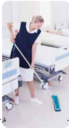
2 Apply Apply the cleaning product to the floor.