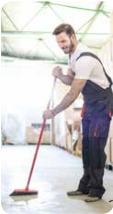
1 Sweep Always sweep the floor before proper cleaning.

The best method for cleaning Flowcrete floors is to have a five step process. This process varies between small and large floors and between textured and smooth floors.