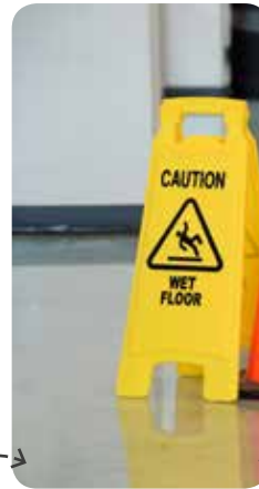
4 Soak Allow time for the cleaning product to sit on the floor.